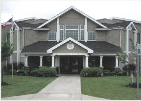
4791 William Street Lancaster, NY

Developed in 2002, Woodland Place offers seniors age 55 and up comfortable, affordable living in a beautifully landscaped wooded setting. Each of Woodland's 86 attractive one - and two-bedroom apartments features appliances and central air conditioning. Smoke-free and pet-friendly, the complex also provides residents ample, well-lighted parking and 24/7 emergency maintenance.