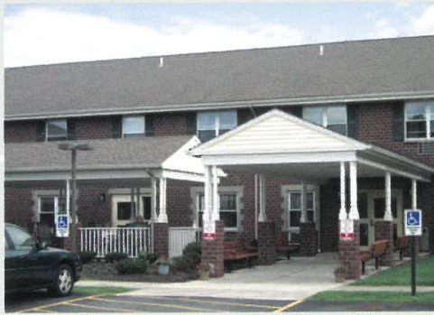
West Seneca 2002