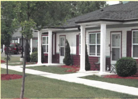
65 Captain's Way Wheatfield, NY

Shawnee Landing began offering affordable one, two, three and four bedroom apartments for individuals, families, seniors and persons with disabilities in 2008, providing the community with greater choice in quality housing. Residents of the pet-friendly, smoke-free property enjoy many amenities, including appliances, on-call repairs and an attractive community center.