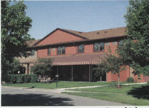
Grand Island 1987